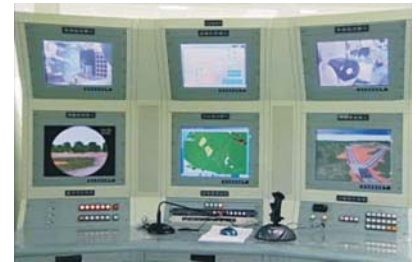
Instructor Operation Station

Either the Driver Trainer or the Turret Trainer can be exercised independently. They can also work together synchronously to provide multiple-crew training. All training activities are controlled and monitored from the Instructor Operation Station.